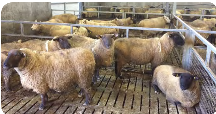
The Sheep Shed at Mountbellew