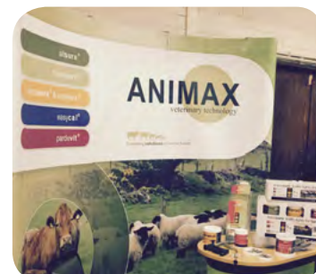
Animax Stand at Mountbellew Sheep Seminar. Animax supply a range of trace element boluses