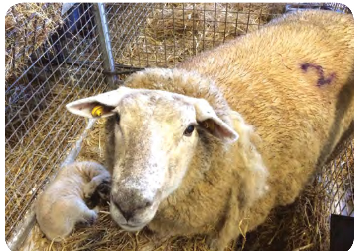
A Proud Ewe with Lamb in the Mountbellew Sheep Shed