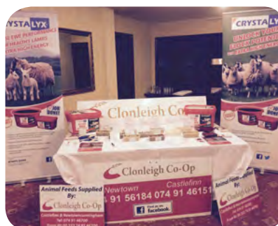
Clonleigh Co-Op at Ballybofey Sheep Seminar