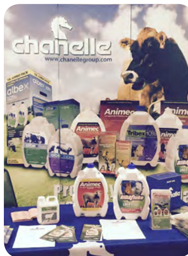
Chanelle Veterinary, manufacturers of Ridafluke