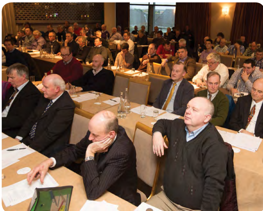
Delegates at a packed ICSA AGM and Annual Conference

"Rural broadband is a disgrace. We need a full scheme for hen harrier farmers and we need it now."