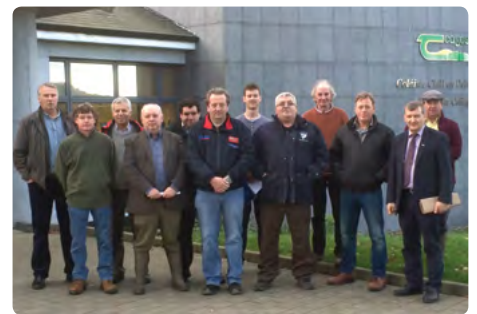
Some of the attendees at ICSA's Kildalton Event