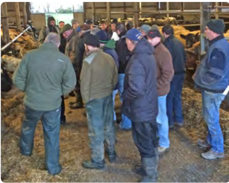
The Suckler Shed at Gurteen