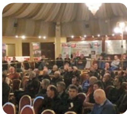
Large Crowd in attendance at Ballybofey Sheep Seminar