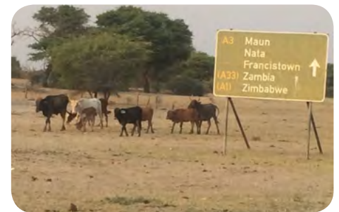
Cattle roam freely on communal farms and, even on the highway, they regularly cross the road

ICSA's job in Botswana was to help the farmer associations collaborate with each other and to develop a more professional approach towards lobbying, press and communications and the general management and governance of an association.