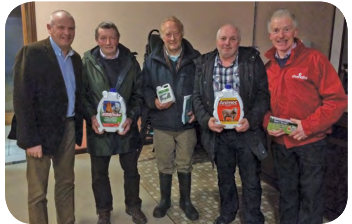
Prize winners on the night with the Chanelle team