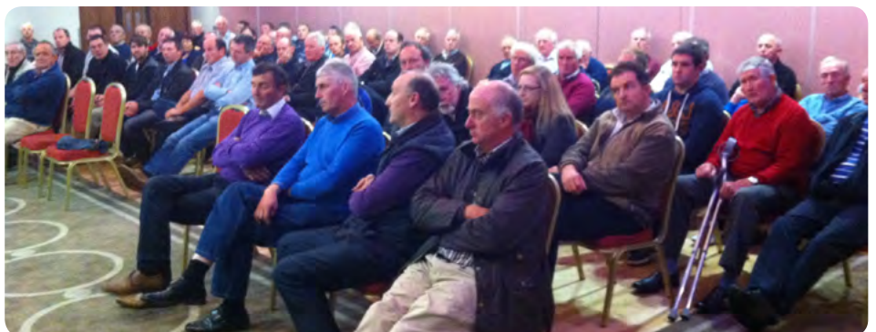
ICSA hosts Greenway concerned farmers in Loughrea, Co. Galway

ICSA has committed to remaining vigilant on the issue. While this result was good news in the short-term, local farmers would have to continue to stand together if and when the plans are resurrected. Governments need to recognise that tourism projects can only be successful with the goodwill of those most directly affected. It is a profound mistake to think that the will of local communities can be trampled upon and ICSA hopes that this lesson will be learned for any future plans.