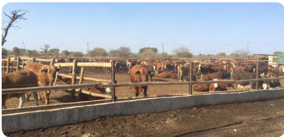
Cattle in the feedlot are a mixture of continental and traditional European breeds typically crossed with the native Brahman which are very adapted to the heat

Even though June is the middle of the winter in Botswana, daytime temperatures were a pleasant 27 degrees, but it got chilly at night. The second visit was undertaken