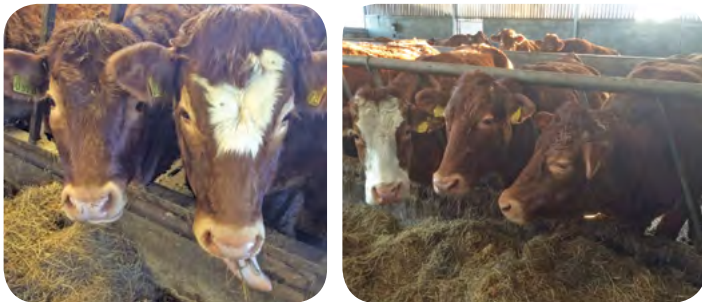
Shining Examples of the Mountbellew Limousin Suckler Herd